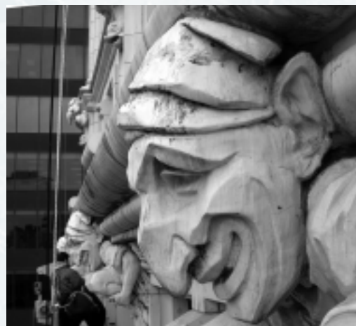
55 Liberty Street terra cotta detail

The restoration of the Bell Tower and surrounding mission tile roofs at the Cloisters Museum were recognized with a Lucy B. Moses Award last year.